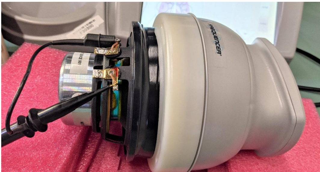
Figure 2: Transducer and loudspeaker setup

The critical step is to correctly install the transducer and the loudspeaker. In Figure 2, the loudspeaker is directly applied on the transducer. This is similar to the normal use of the Frequency® where the transducer is directly applied on the chest.