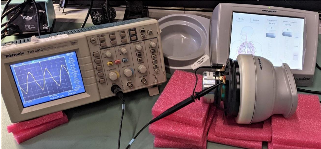
Figure 1: Test Setup

First, the equipment is installed as indicated by Figure 1.